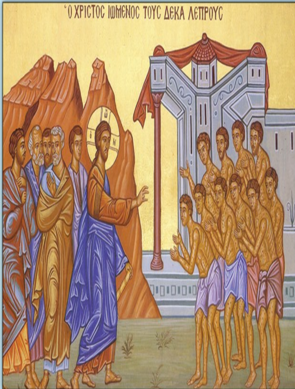
Icon of the Healing of the Ten Lepers (Luke 17:12-19)