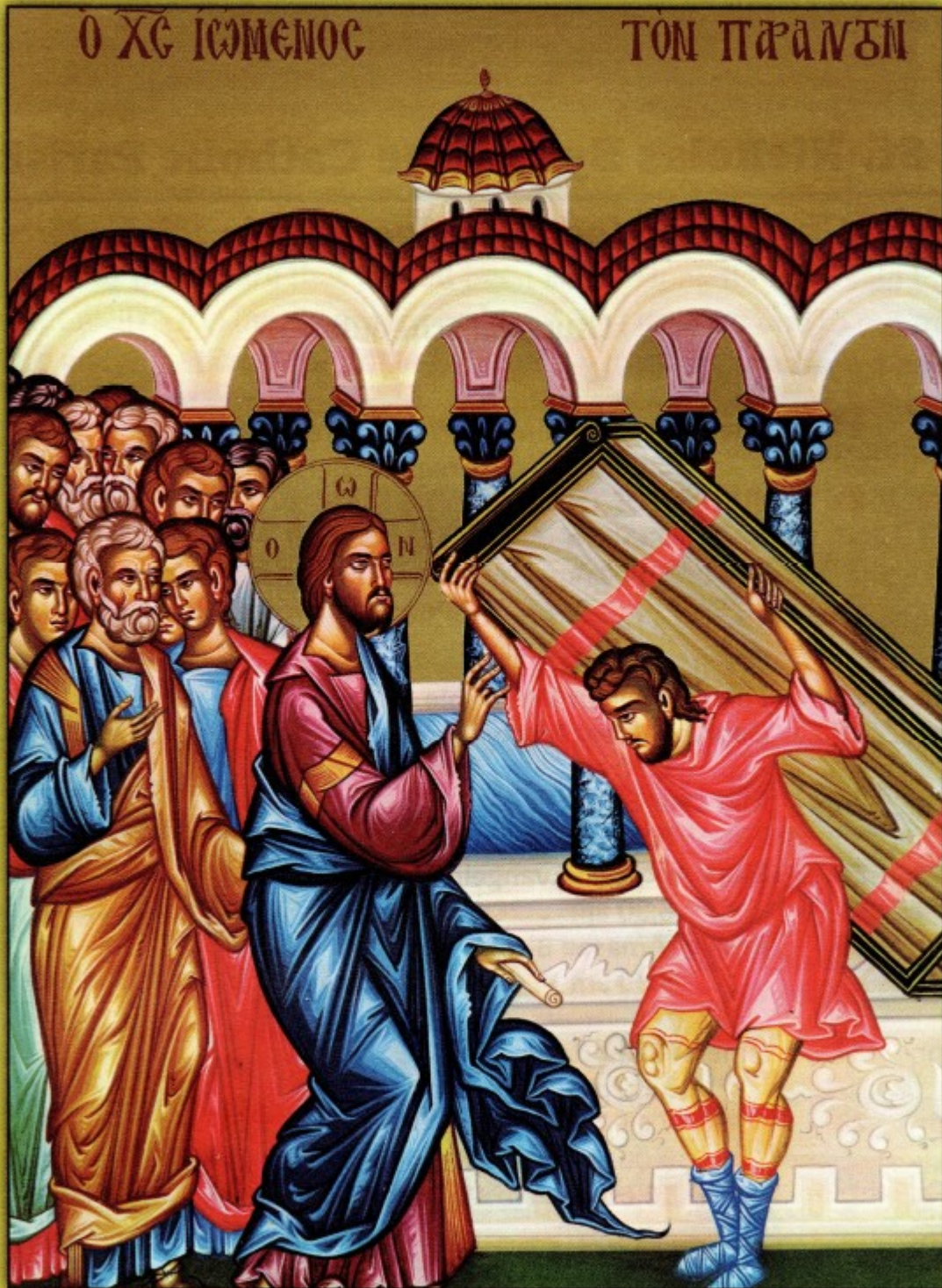
Icon of Jesus Healing the Paralytic Man