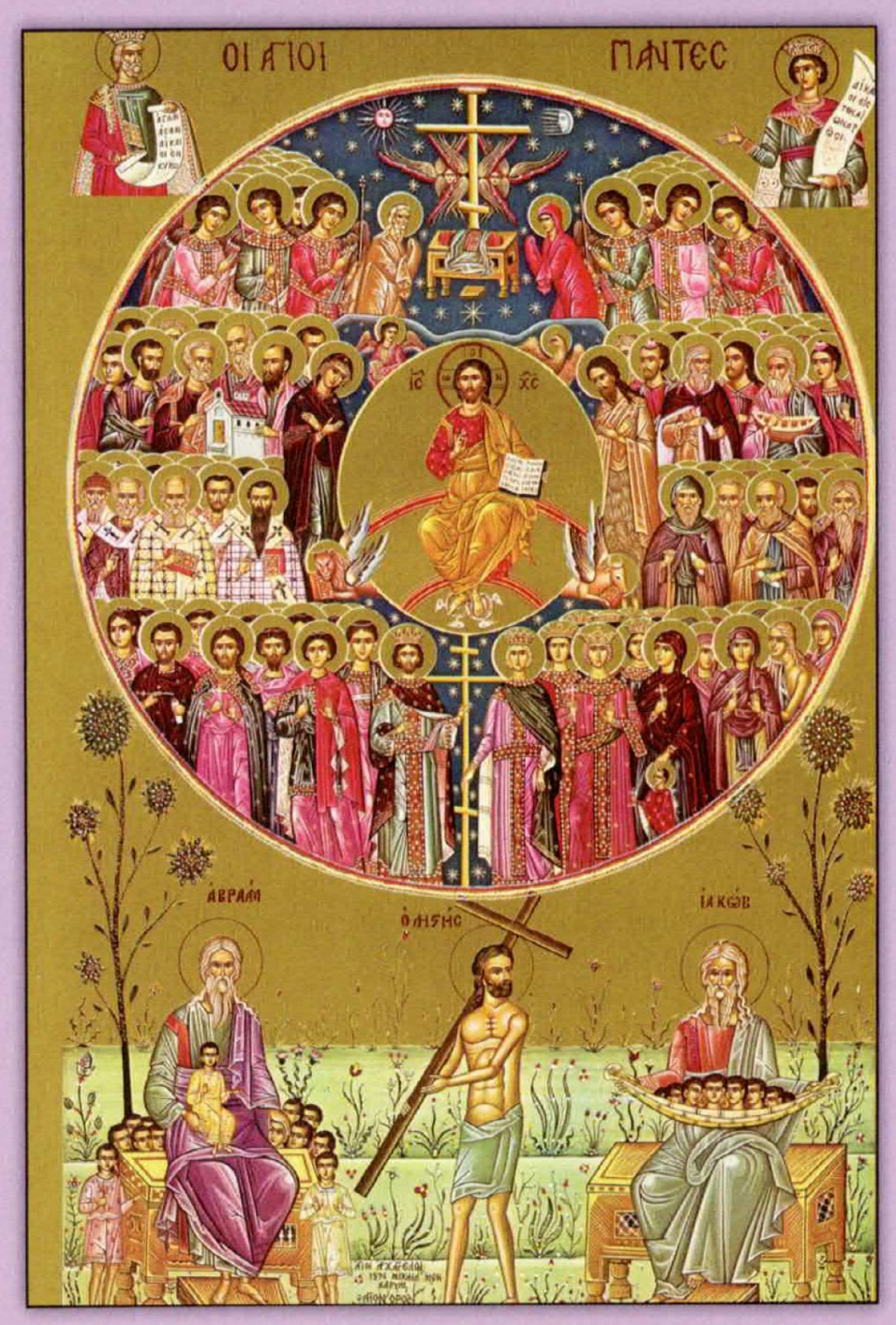
Icon of All Saints