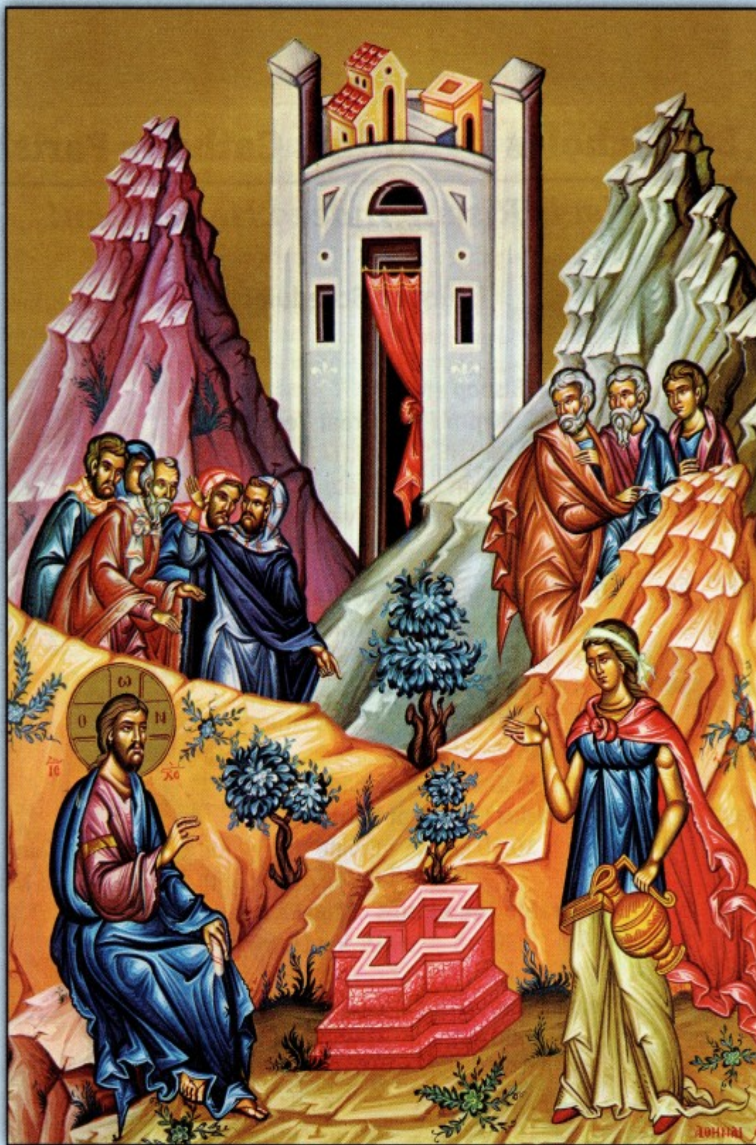
Icon of Christ with the Samaritan Woman