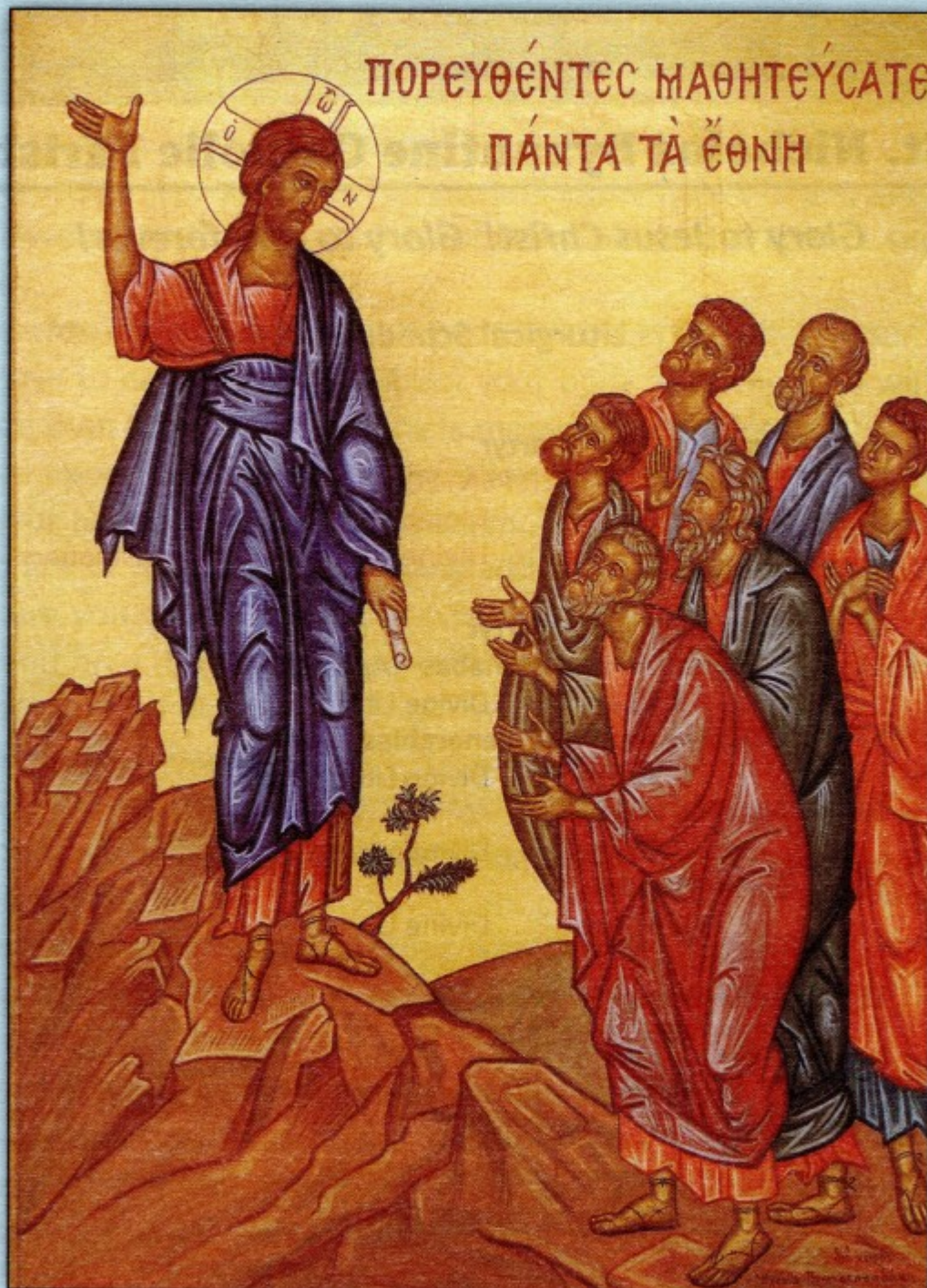
Icon of Jesus preaching to His Disciples