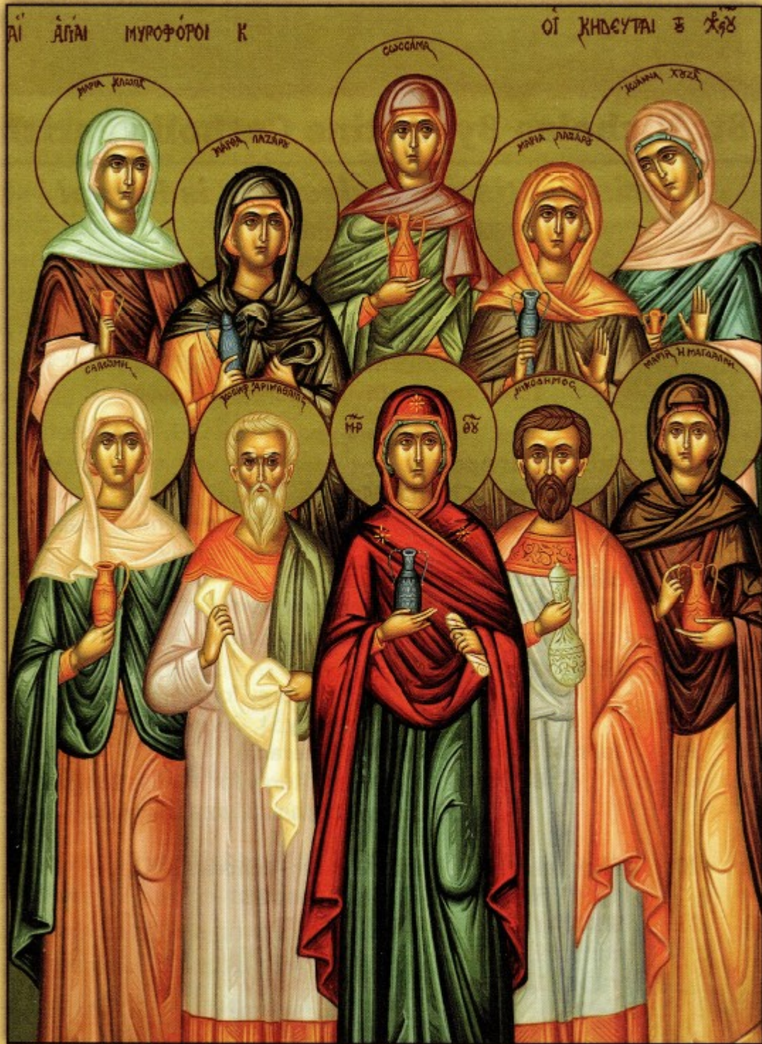
Icon of the Myrrh-bearing Women