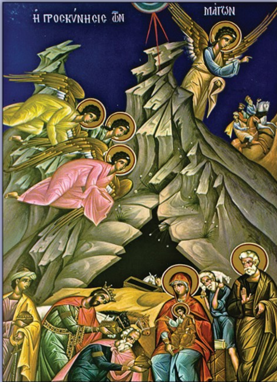
Icon of the Visit of the Magi