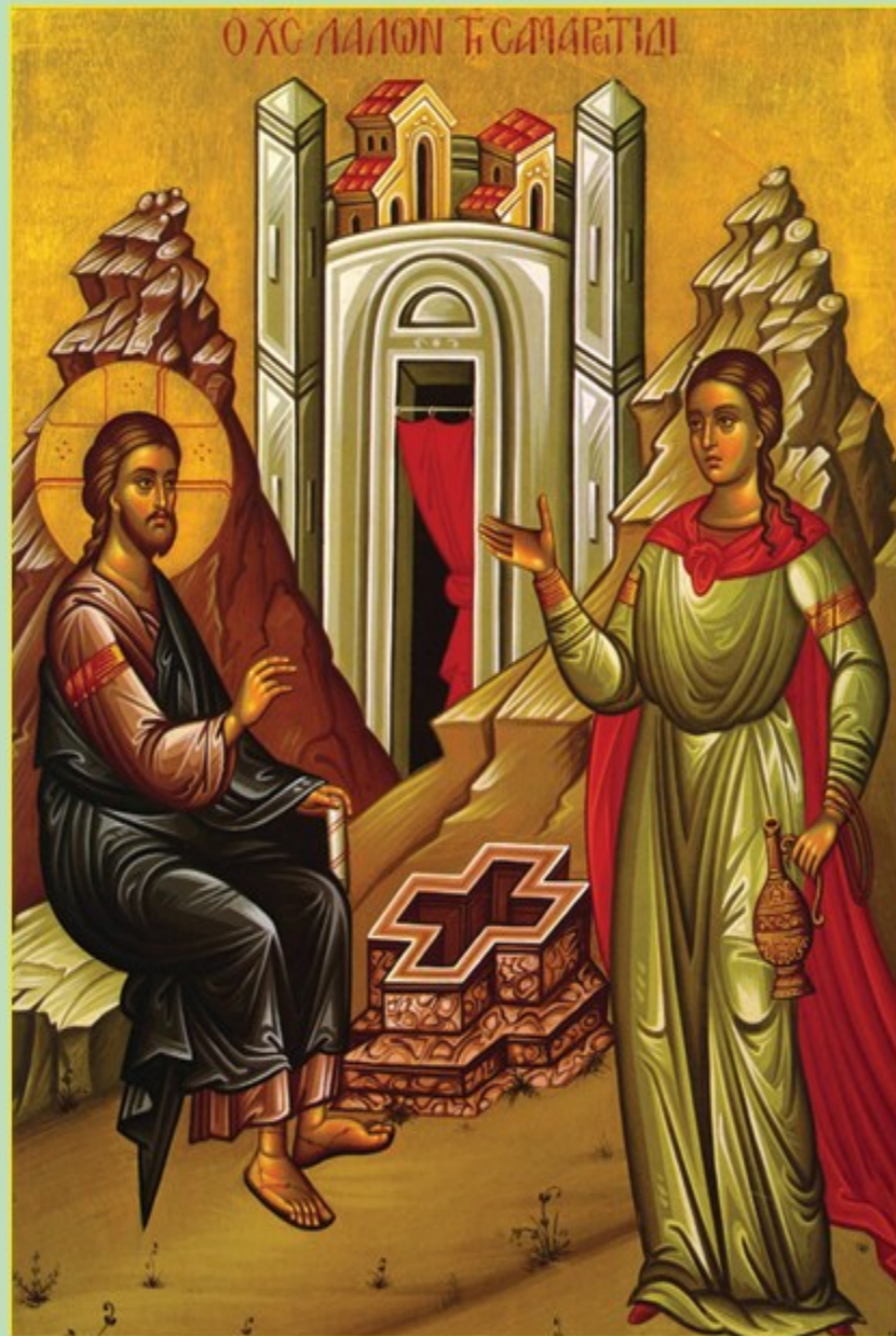
Icon of the Samaritan Woman